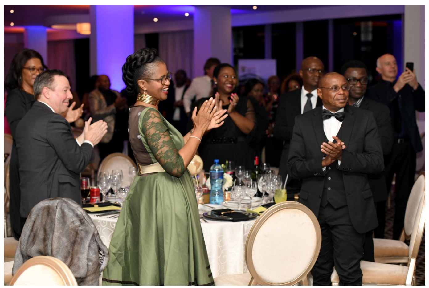
The USOAP-1000 Gala in South Africa

IS : The celebration of the 1000th USOAP activity started long before the audit with media and social media placements shared by ICAO and the SACAA. The Department of Transport of South Africa in partnership with ICAO arranged an event to commemorate the 1000th USOAP activity. This event was hosted by South Africa through the SACAA in collaboration with ICAO, and this was indeed a success. In attendance were both the Minister of Transport, Hon. Sindisiwe Chikunga, and the Deputy Minister of Transport, Hon. Lisa Mangcu, the SACAA Board of Directors, ICAO Deputy Directors, the Director of the SACAA and Executive Team, key South African industry players, the ICAO audit team, the SACAA staff members, and members of various media entities. Capt. Guindon, DD/MAC, was actively engaged on behalf of ICAO with the media as several interviews were lined up to discuss the significance of the audit programme. This celebration, although held in South Africa was indeed a global milestone for civil aviation. ICAO as part of celebrating this milestone gifted the Minister, Deputy Minister and the Director of Civil Aviation with coins commemorating the 1000th USOAP activity. South Africa is indeed proud to have been part of this history which has left a lasting impact on the South African industry and the world.